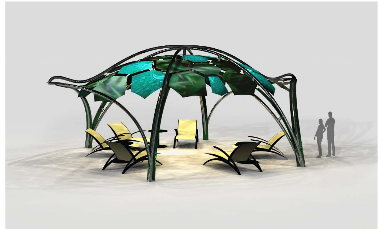
4 TURTLE POD RENDERED VIEW SCALE: NTS